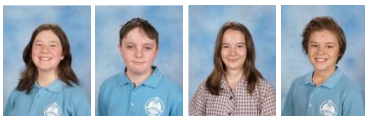
Our 2018 Year 8 Leaders

On a less formal but none the less important level all students are urged to take responsibility for their own learning and the learning of their fellows by demonstrating a mature approach both to their studies and academic performance along with their general social development and relationships within the school.